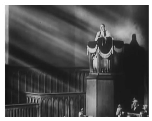
Illustration 6. The gleam of light intensifies Dr Arnold. Time 8:40-8:48.

be that this setting matches with the austerity of the Puritan church<sup>26</sup>. Needless to say there are evident similarities between the Manifest of Destiny and Dr Arnold's speech<sup>27</sup>. These schoolboys are the chosen ones to begin a new generation that will change the face of education of England as Dr Arnold's character says.