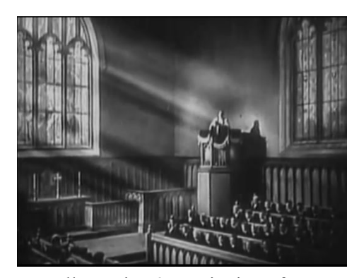
Illustration 2. Beginning of Dr Arnold's sermon. Time 7:24-7:28.

As portrayed in «the oak pulpit standing out by itself above the School seats» (Hughes, 1857: 141), Dr Arnold is standing over the schoolboys' heads. Light falling from his right side is used to enhance the whole pulpit and consequently several shades of grey appear (illustration 2). The stream of light is especially reflected against Arnold's figure with maximum brightness to give meaning to Hughes' description when he wrote that Arnold stood there with his spirit full of «righteousness and love and glory» (Hughes, 1857: 141). That light effect darkens the remaining parts of the scene significantly highlighting the focus of attention: Dr Arnold in his sermon. Likely, this technique attempts the display of the divine light to capture the meaning visually. While the mischievous schoolboys sit in darkness, Dr Arnold stays on the right side with light. Given that the ray of light is directly sent to Dr Arnold, the audience can see his shadow so that Arnold's projection is three-dimensional<sup>22</sup>. When spectators hear the word 'corrupted' (illustration 3), there is a close-up on Dr Arnold dressed in white to reflect the light His sight inspires solemnity and respectfulness and his voice is loud and clear<sup>23</sup>.