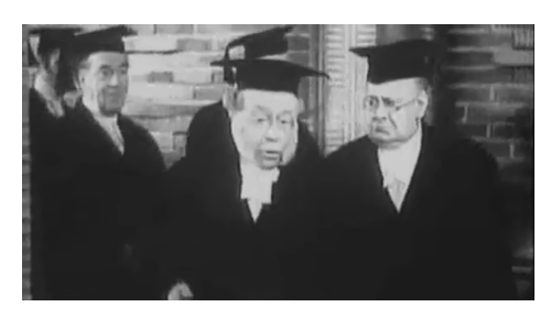
Illustration 9. Tutors disapproving the headmaster. Time 9:24-9:31.