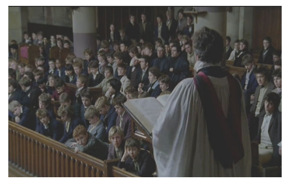
Illustration 13. Schoolboys in the sermon. Time 24:14.

Moreover, the acting technique is much more natural than in Stevenson's adaptation. Each schoolboy acts individually, not in unison. It shows a varied range of stories and motives among all the schoolboys (illustration 13). Diversity creates a better sense of authenticity. Body language and facial expressions convey as much as the meaningful words told by the headmaster. Arnold's speech on the screen is to be understood as a teaching lesson for victims of bullying: «It is therefore no disgrace for the bullied to come forward and point the finger at the bully» (illustration 14).