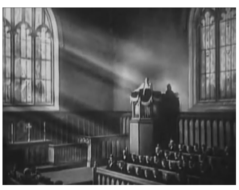
Illustration 7. Long shot indoors. Time 9:12-9:19.

Beginnings and endings determine the structure of such literary pieces and this is not an exception. After a condensed speech full of great prospects for the future, spectators face a humoristic sketch when tutors are leaving the hall. «I'll give him a year, ... six months» (illustration 8). Here the director seeks complicity with the audience. Instead of a large argument, the tutors act naturally disapproving the headmaster's view. «Moral principles, what's the school going to do with moral principles? Feeding one end, beating the other. That's education» (illustration 9). This ending shows the other side of the coin, the opposite side that Dr Arnold has to fight against. Good and evil have been introduced and the mission is on the way to being accomplished. To summarise, this scene adaptation provides an easy reading for American audience because of the familiar Puritan setting and the similarity with the Manifest of Destiny.