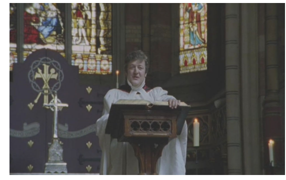
Illustration 12. Holding his hand on the open Bible. Time 24:48.