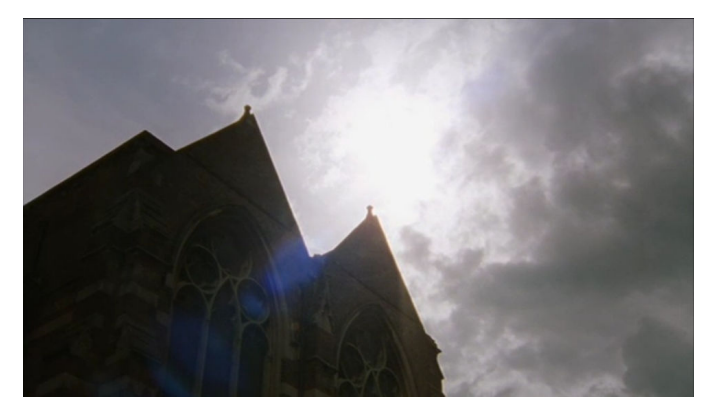
Illustration 10. Exterior shot of the chapel. Time 24:01.

This indoor setting has nothing to do with the simple outlook in Stevenson's film adaptation. The abundance of luxuries is widely displayed around the chapel. For example, some large painted windows, many golden decorations on the wall and two large crosses: one in silver and the other one in gold. From all this it can be easily interpreted that these schoolboys belong to wealthy families, and consequently, to a particular social class<sup>28</sup>. This time Dr Arnold is performing in a closer position rather than in a top pulpit when he says «A place of light and learning and goodness» (illustration 11). In contrast, he is preaching with his right hand lying on an open bible (illustration 12).